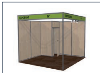
Visual not contractual